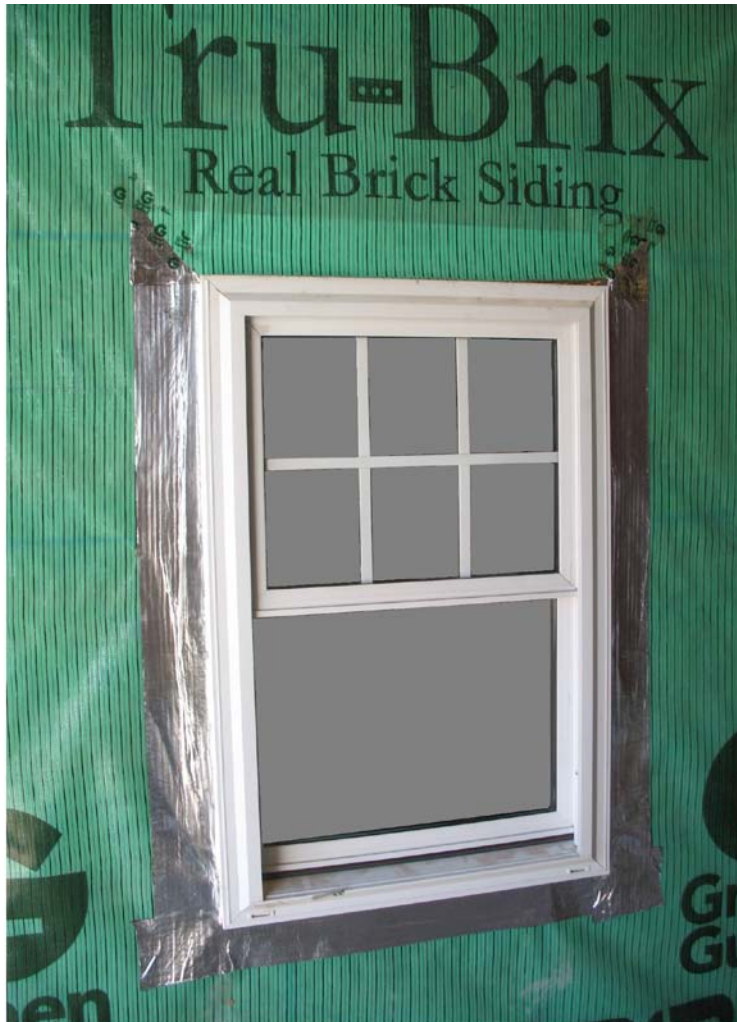
Figure 5; Window with Drainage Wrap and Flashing

Results; Examinations of the results show that correct window flashing details are required to prevent water penetration at window heads. The correct installation is shown in Figure 5. The Drainage Wrap must be cut to install window head flashing underneath the Wrap. Any moisture in the Drainage Wrap will then be removed from the wall by the window head flashing.