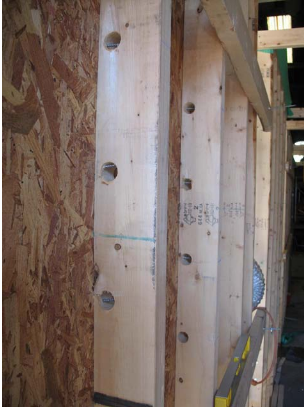
Figure 2; Observation holes at anchoring screws in wood studs

The test walls were constructed with a trough below the test area to collect water. (See Figure 1) The procedure called for measuring the water that was collected in the trough, measuring any water that might penetrate into the drainage wrap and drain to the bottom of the test panel, and observing any wetness behind the sheathing with emphasis on monitoring the screw penetrations.