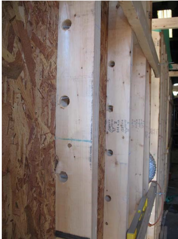
Figure 2; Observation holes at anchoring screws in wood studs

The test walls were constructed with a trough below the test area to collect water. (See Figure 1) The procedure called for measuring the water that was collected in the trough, measuring any water that might penetrate into the drainage wrap and drain to the bottom of the test panel, and observing any wetness behind the sheathing with emphasis on monitoring the screw penetrations.