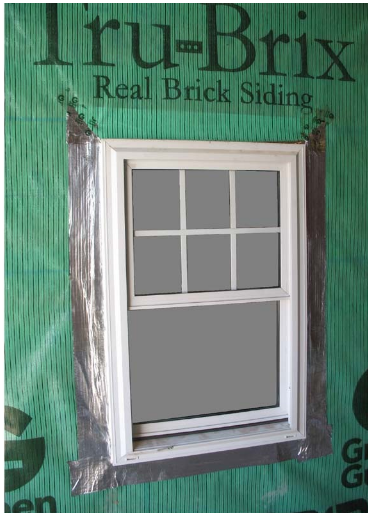
Figure 5; Window with Drainage Wrap and Flashing

Results; Examinations of the results show that correct window flashing details are required to prevent water penetration at window heads. The correct installation is shown in Figure 5. The Drainage Wrap must be cut to install window head flashing underneath the Wrap. Any moisture in the Drainage Wrap will then be removed from the wall by the window head flashing.