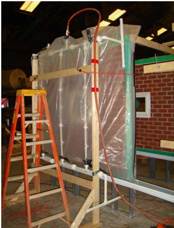
Figure 3; E1105 Setup

Type 2: Tru-Brix siding installed over 5/8" Fiberglass faced exterior gypsum sheathing (Georgia Pacific Dens-Glass Gold) on 18 gage steel studs spaced at 16-inches on center. A non-flanged 16" x 16" window was installed with standard construction methods. The E1109 spray apparatus was set up the same way as for Type 1.