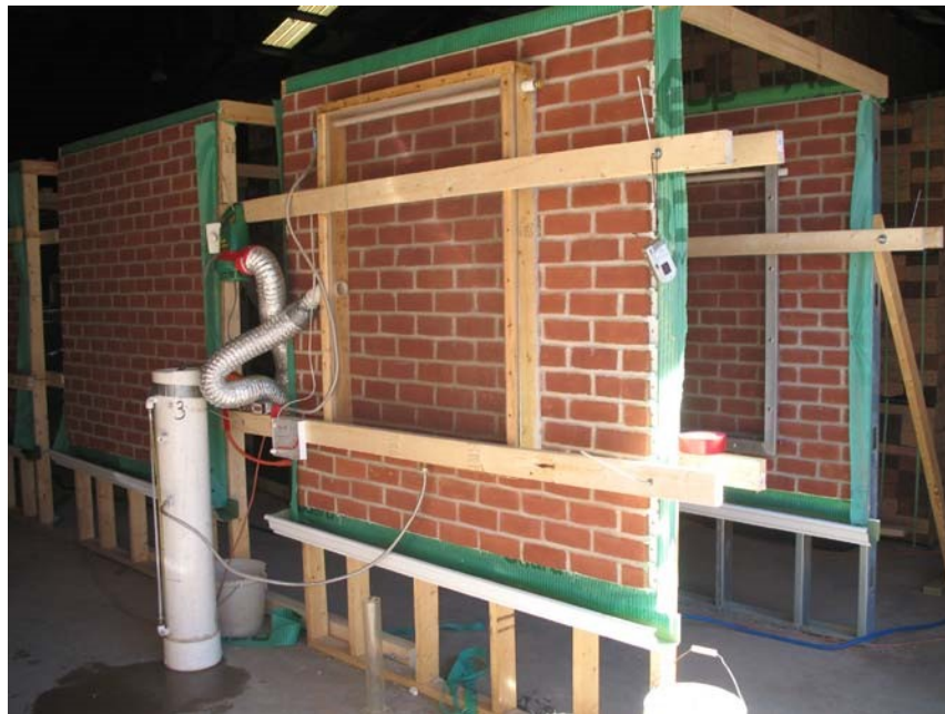
Figure 1; E514 Test Chamber on Wood Stud Sample Wall (foreground) and Metal Stud Wall (behind)

Type 2; Tru-Brix siding installed over 5/8" Fiberglass faced exterior gypsum sheathing (Georgia Pacific Dens-Glass Gold) on 18 gage steel studs spaced at 16-inches on center. Three wall samples of 6-ft x 6-ft were built and two were tested. The E514 Test chamber was 40"W x 48"H and attached in the approximate center horizontally, and 2 courses from the top, on each test wall. (See Figure 1)